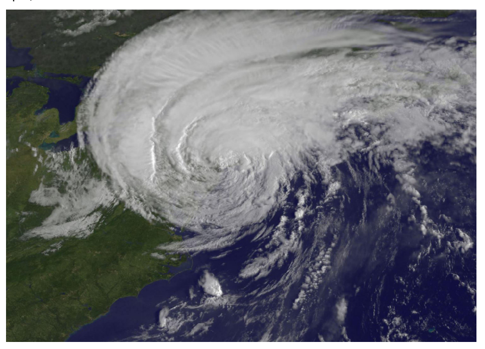
Figure 8.13 Storm from Space. This satellite image shows Hurricane Irene in 2011, shortly before the storm hit land in New York City. The combination of Earth's tilted axis of rotation, moderately rapid rotation, and oceans of liquid water can lead to violent weather on our planet.

Climate is a term used to refer to the effects of the atmosphere that last through decades and centuries. Changes in climate (as opposed to the random variations in weather from one year to the next) are often difficult to detect over short time periods, but as they accumulate, their effect can be devastating. One saying is that "Climate is what you expect, and weather is what you get." Modern farming is especially sensitive to temperature and rainfall; for example, calculations indicate that a drop of only 2 °C throughout the growing season would cut the wheat production by half in Canada and the United States. At the other extreme, an increase of 2 °C in the average temperature of Earth would be enough to melt many glaciers, including much of the ice cover of Greenland, raising sea level by as much as 10 meters, flooding many coastal cities and ports, and putting small islands completely under water.